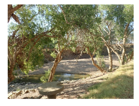
Figure 2. Water Monitoring, Flinders River Picnic Area. October 2018

Ecology surveys were also carried out to see if any additional species could be identified on site, at a different time of year. One air quality logger is still in place and will remain for a further 6 months.