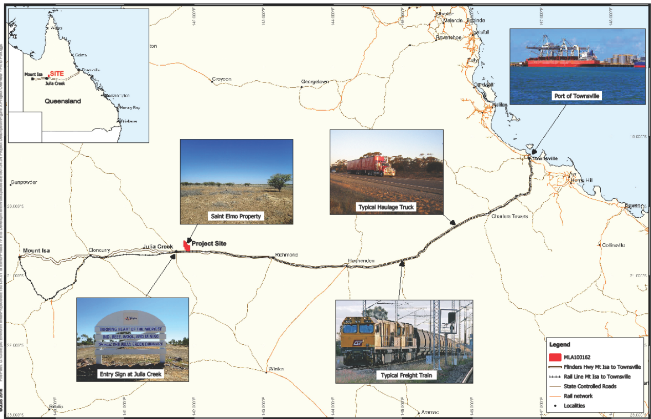
Figure 1: Regional Project Catchment

Based on the known demographics of the region, it is expected that 75 percent of the workforce will be able to be sourced from Options 1 or 2 below and will largely be able to reside in their own homes. Up to 25 percent of the workforce will be sourced from outside the region. Recruitment will prioritise: