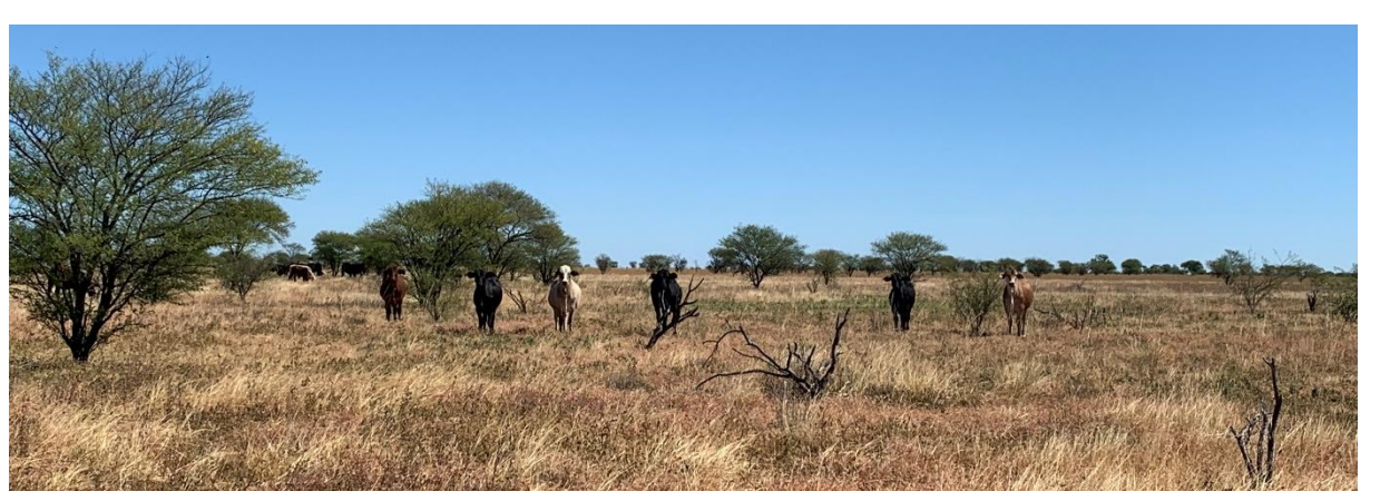
Figure 4: Saint Elmo Project Site, Fieldworks, May 2019