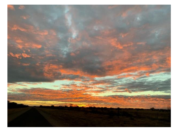
Figure 1: Saint Elmo Project Site at Sunset, May 2019